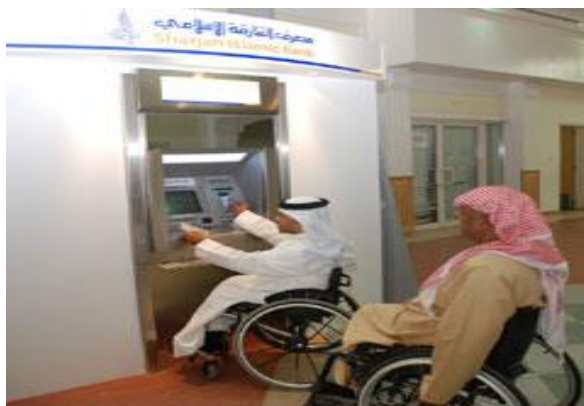
F4: Accessible ATM in shopping Mall