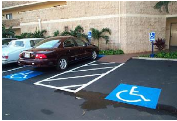
F3: Accessible parking

Features of accessibility at airport: It has been recommended that airport should include the following accessibility: