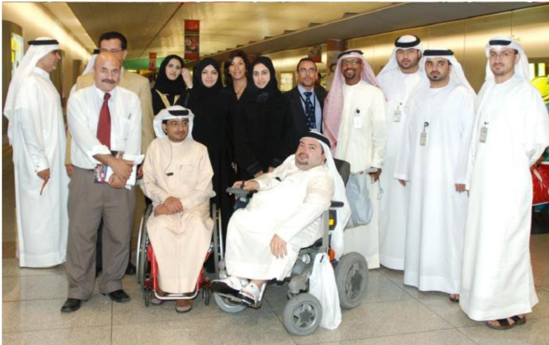
F1: Members of the Committee visiting Dubai International Airport

This committee began to assess accessibility in Dubai public places and transport. Committee members carry out a number of activities Including visiting busy public places to ensure their full compliance with accessibility standards such as airport and Dubai Metro ( was under construction at the time), the first visits was to Dubai airport and Dubai Metro project.