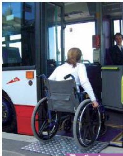
F5: accessible public bus in Dubai