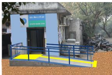
Figure 4. Retrofit design for ATM facility

Access creation in educational campuses requires a sensitive approach with strategic planning. UDIP have established a contextual dimension of UD applications in Indian scenario and are available for wider application. This paper concludes with two major observations. Firstly, introducing access in informal spaces of educational campuses would truly enhance the spirit of inclusion in education and campus living. Secondly, UDIP as a theory can play a significant role in creating access and inclusion as an applied concept. Informal campus spaces, usually an ignored dimension play a significant role in social cohesion through their functioning. The degree of inclusion offered through its informal spaces would therefore be an important measure for campus inclusivity. In a campus context like JNU, the plurality of regional cultures and diversity of human forms need to be comprehended under the term inclusion. It is to emphasize that access improvisation through informal campus spaces could become an important tool to manifest social integration and hence promote inclusion.