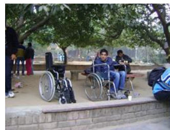
Figure 3. Informal Seating Space