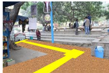
Figure 5. Improved access through paving