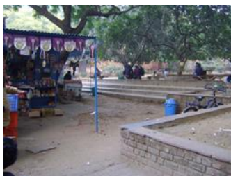
Figure 2. Snack Canteen Space